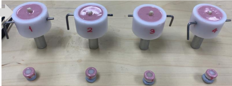
The sectioned tooth was fixed into a composite material in a jig to oppose each different brand of zirconia for comparative wear test.