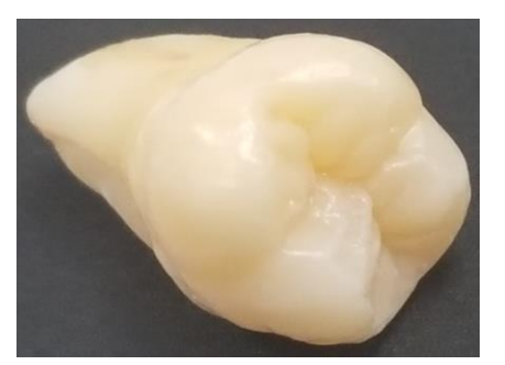
An adult molar with 4 distinct cusp tips was chosen for consistency in the density of a testing sample.