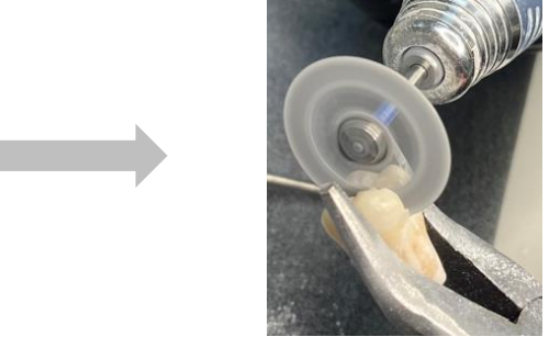
Then the tooth was sectioned into 4 equal parts.