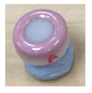
Each different brand of zirconia sample was prepared according to Instructions for Use.